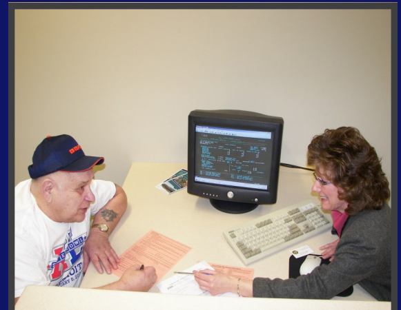
Senior Specialist helping a Lockport senior complete his exemption application.